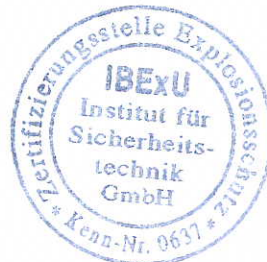
- Seal - (ID no. 0637)