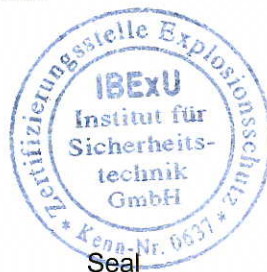
Seal (ID no. 0637)