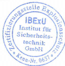
Seal (ID no. 0637)