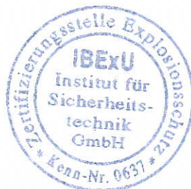
Seal (ID no. 0637)