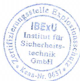
Seal (ID no. 0637)