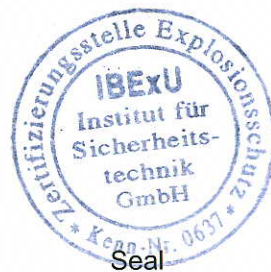
Seal (ID no. 0637)