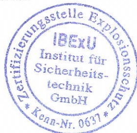
Seal (ID no. 0637)