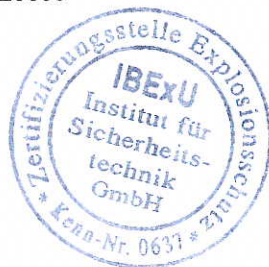
Seal (ID no. 0637)