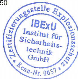
Seal (ID no. 0637)